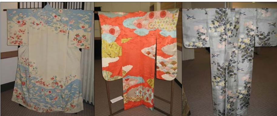
Some of the beautiful kimonos on display

This was a lovely morning, at the heart of which was peace, friendship and beauty.