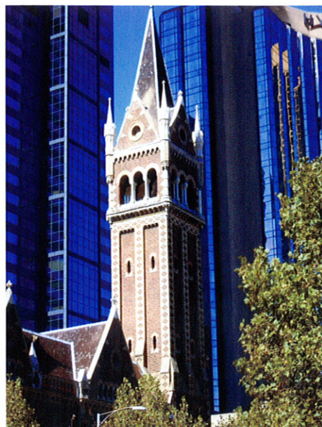
St. Michael's Church, Melbourne

As we search for many pathways to be a supportive therapeutic community of inspiration and hope, so we search for ways to a New Faith that speaks meaningfully to people